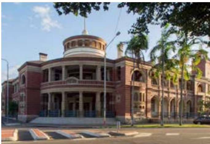
Former Customs House