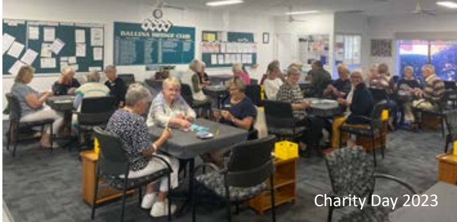
Charity Day 2023